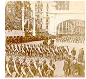
4 th Pennsylvania Regiment Philadelphia Peace Jubilee 27 October 1898