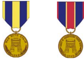
Spanish and Puerto Rico Occupation Medals