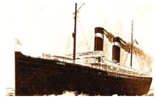
USS St. Louis