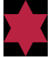
6th Infantry Division